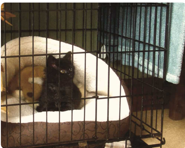
An example of a safe place for the kitten to sleep in overnight.