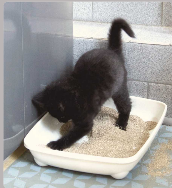
An example of a low sided litter tray suitable for kittens.

For more in-depth information about litters and trays go to: icatcare.org/advice/litter-trays