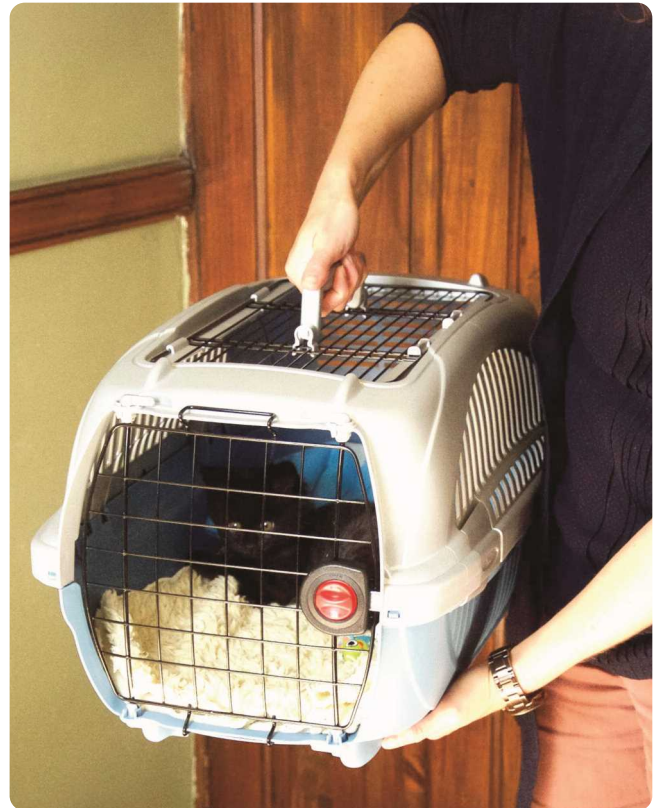
How to carry and support a cat carrier.